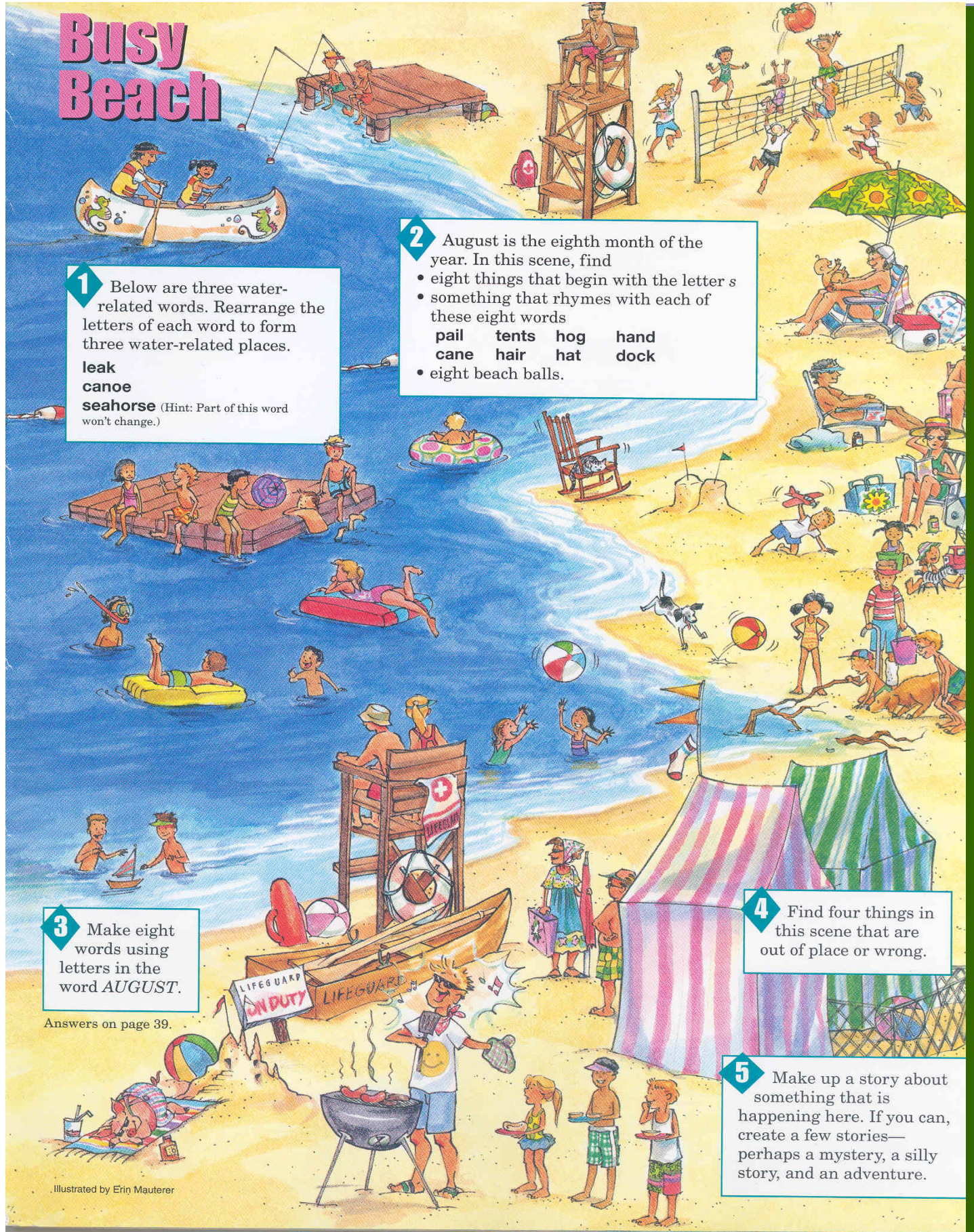
Illustrated by Erin Mauterer

5 Make up a story about something that is happening here. If you can, create a few stories—perhaps a mystery, a silly story, and an adventure.